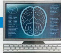
Figure out how 100 billion neurons communicate